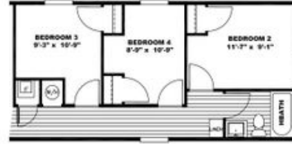
4 BEDROOM OPT.