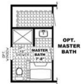
OPT. MASTER BATH