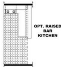
OPT. RAISED BAR KITCHEN