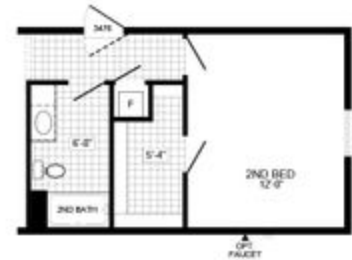
OPTIONAL 2-BEDROOM VERSION