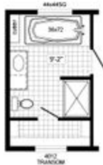
OPTIONAL GLAMOUR BATH #6