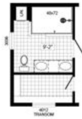
OPTIONAL GLAMOUR BATH #7

https://www.claytonhomes.com/homes/74DYN16783EH