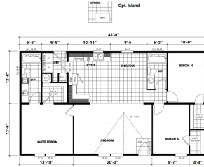
DREAM SERIES SILVER 27x48 DRM 481F 3 BEDROOM, 2 BATH - 1,296 SQ. FT.